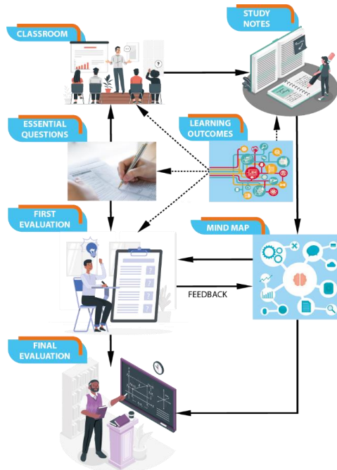
Figure 1: Flow chart of the evaluation and feedback process.

generated by the students and which became part of the activities requested for summative evaluation. These class notes should not be a transcription of the slides and notes of the teacher offered as part of the resources provided in the course, but should make explicit the work of extraction and deepening in each of the concepts, characteristics and possible relationships. At this point, the essential questions posed in the classes constituted a first orientation of the teacher towards the expected level of knowledge structuring, allowing students to expand or reorganize their notes.