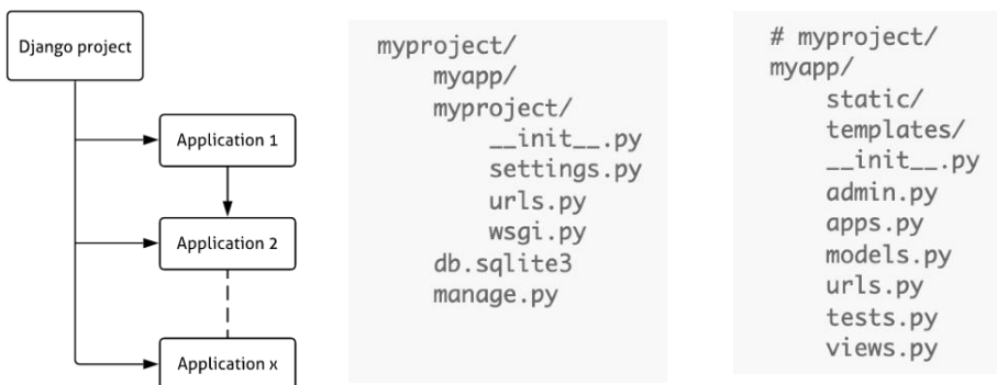
Figure 2. Structure of a Django project.

The structure of a Django project follows the same pattern. A project can be structured into several applications (Figure 2-left) each with its own folder. There are several mandatory files inside a project folder, however we will only discuss the relevant ones for this paper.