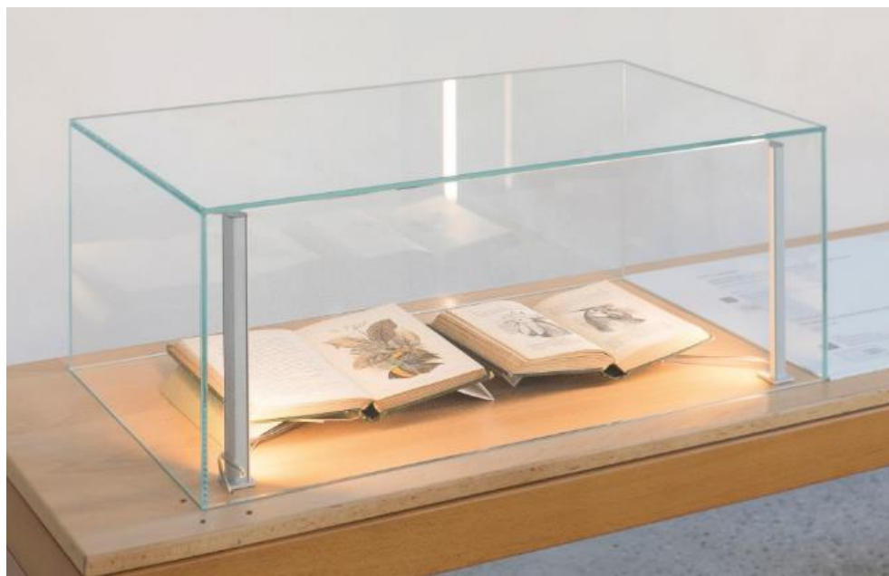
Figure 1. Natura Naturata exhibition of rare books at the University of Ferrara (2019).