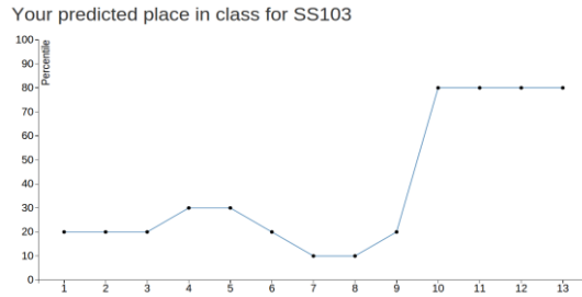
Figure 1: Week-by-week prediction for one student in one module.